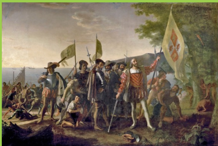
“Landing of Columbus at the Island of Guanahani, West Indies, 12 October 1492”, John Vanderlyn, 1836–47.

Résumé : Catalysis is a key technology of our modern societies, since it allows for increased levels of selectivity and efficacy of chemical transformations. While significant progress can be made by rational design or engineered step-by-step improvements, many pressing challenges in the field require the discovery of new and formerly unexpected results. Arguably, the question “How to discover?” is at the heart of the scientific process. In this talk, we will discuss discoveries from our group based on: 1) mechanistic investigation; 2) observation and analysis of serendipitous findings by the prepared mind; and 3) development and use of rather smart screening technologies.